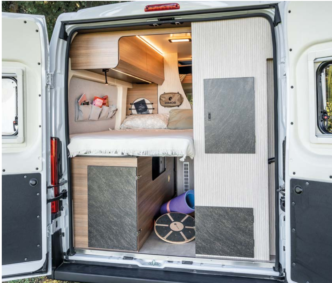
*total berths as standard (including assemblable)