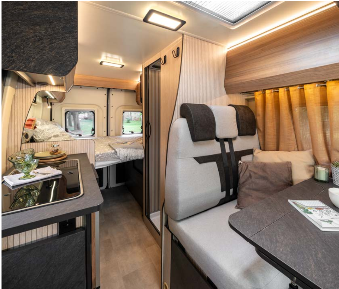
*total berths as standard (including assemblable)